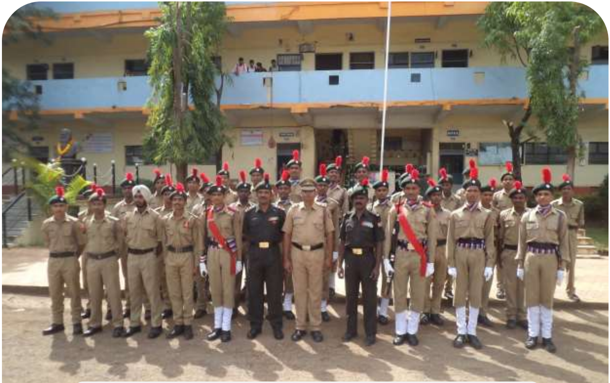
NATIONAL CADET CORPS (ARMY WING)